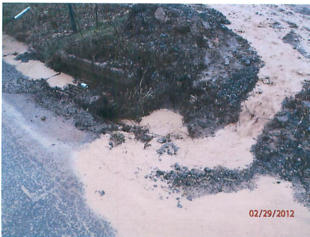
Sediment-laden water leaving the site without passing through an appropriate treatment device flowing through drainages toward White's Run. [P2290304]