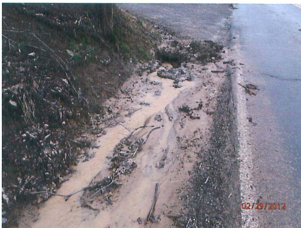
Roadside diversion & culvert below site that DOH has cleared on multiple occasions again full of sediment causing storm water to flow onto the highway during rain events. [P2290158]