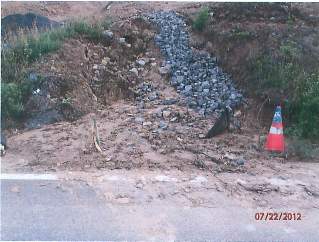
Outlet of sediment basin eroding away onto Route 857.