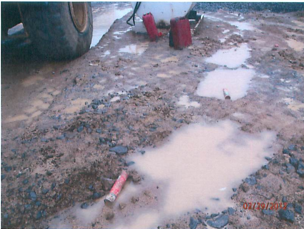
Poor ground water protection: Housekeeping (Pyroplex Red grease cylinders and fuel cans on the ground). [P2290276]