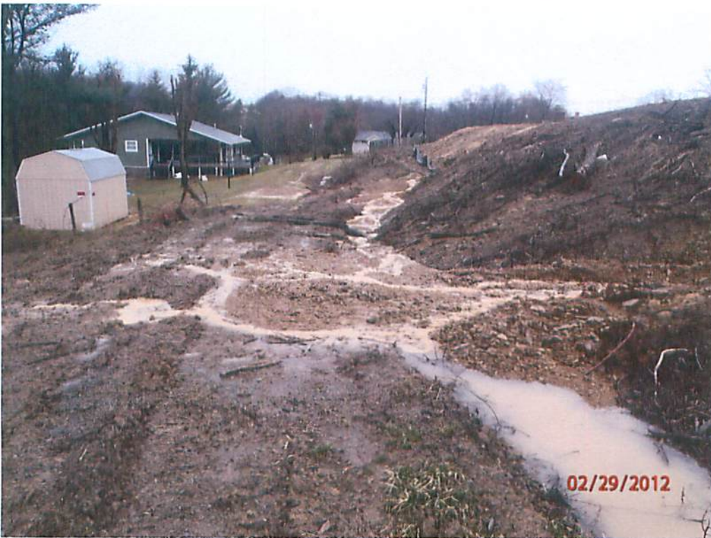
Uncontrolled storm water runoff drainages contributing to Sediment Trap C's bypass. [P2290245]