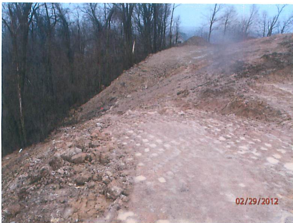
Sediment Trap G not installed allowing sediment-laden water to leave the site without first passing through the appropriate treatment device. [P2290279]