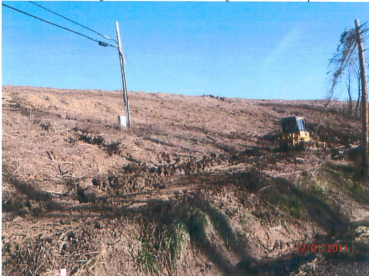
Diversion along Old Cheat Road (CR 857) unstabilized and functional.