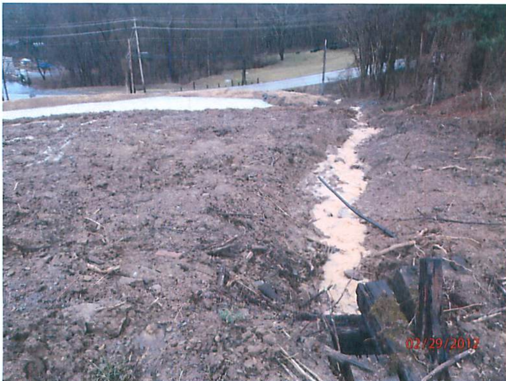
Sediment-laden water leaving down slope toward the highway instead of being diverted to the proper treatment device, Sediment Trap C (upper left with outlet on the wrong end). [P2290252]