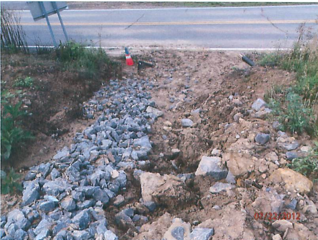
Evidence of sediment-laden water leaving site and onto Route 857.