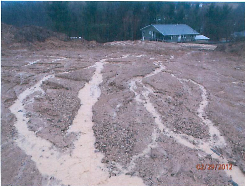
Runoff contributing to deposits onto neighboring property and Sediment Trap C's bypass that is engineered to be diverted to Sediment Trap D via stabilized diversions. [P2290255]