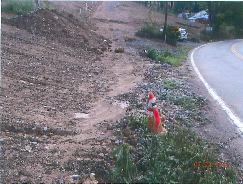
No controls in place along Route 857.