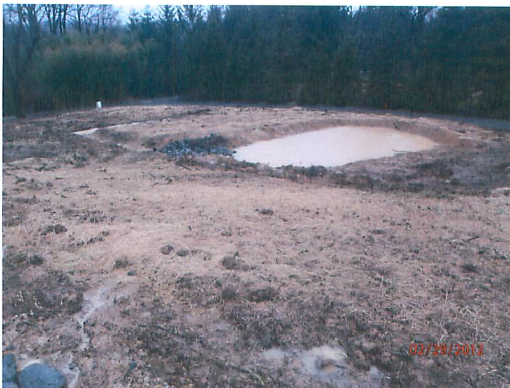
Sediment Trap F not collecting any storm water runoff for treatment before leaving the site. [P2290262]