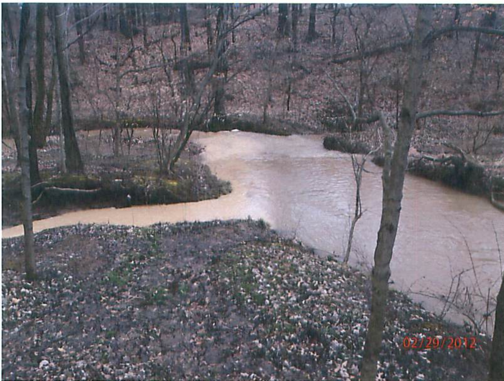
Conditions Not Allowable in State waters: Visible plume into White's Run. [P2290201]