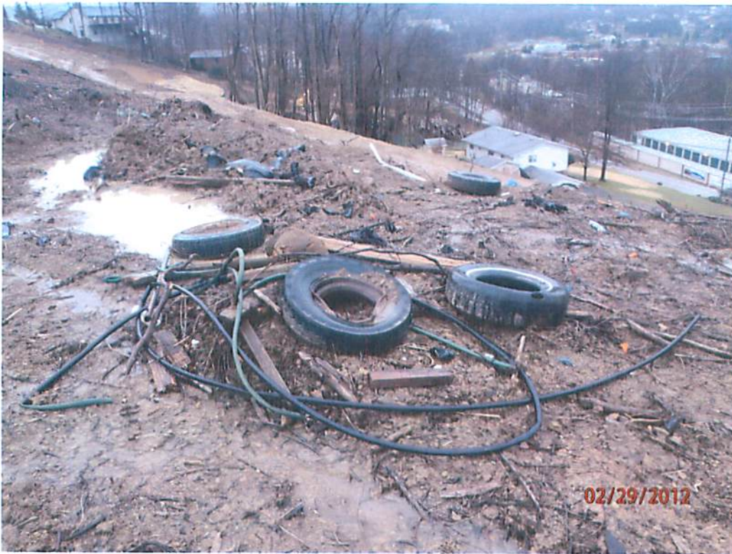
Solid waste disposed of on site. [P2290224]