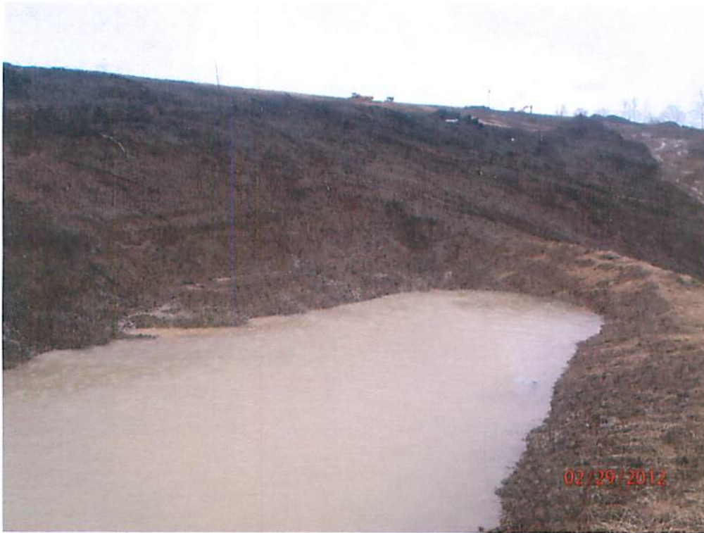
Sediment Trap C not receiving any storm water runoff. The outlet has been installed on the inlet side of Sediment Trap C. [P2290240]