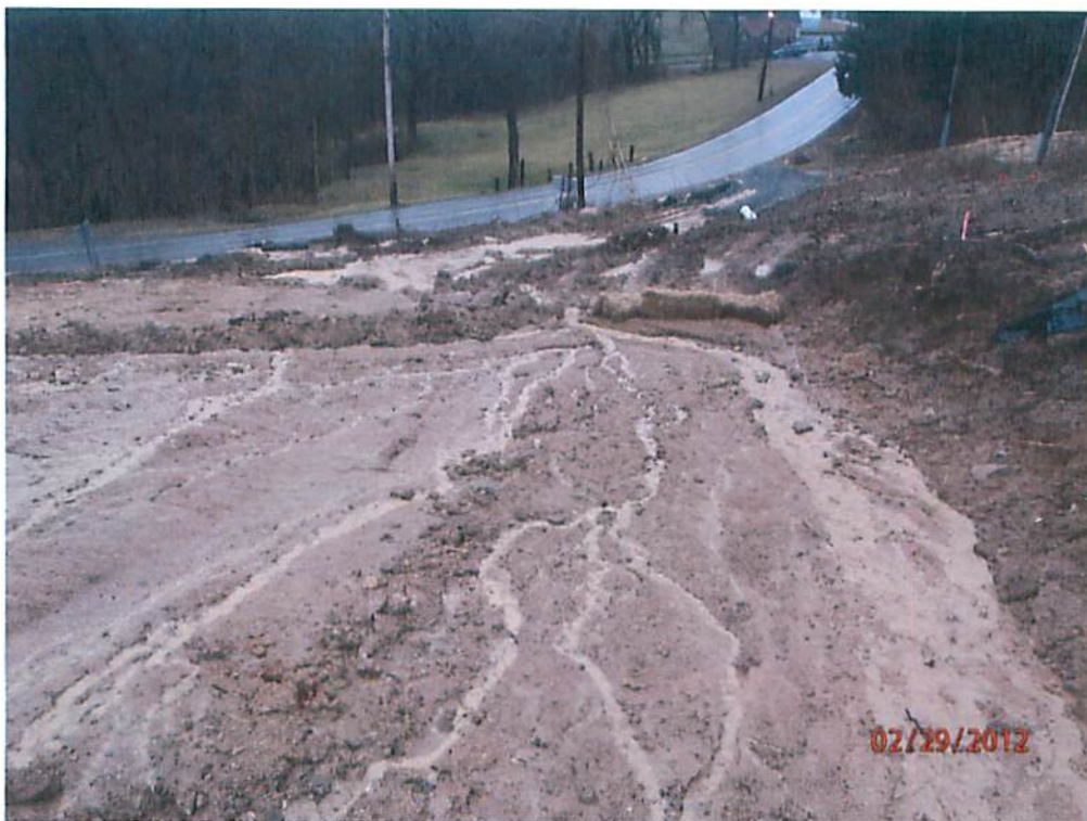
Sediment-laden water leaving down slope toward the highway instead of being diverted to the proper treatment device, Sediment Trap A (not installed). [P2290231]