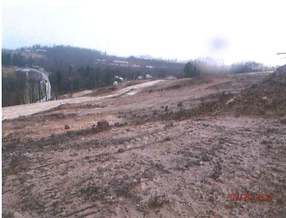
Large areas of disturbed soil left idle >7 days that was not re-disturbed within 21 days with no temporary seeding and mulching practices evident. [P2290286]