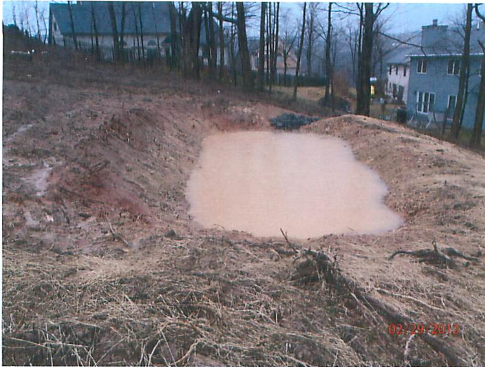
Sediment Trap E not collecting any storm water runoff for treatment before leaving the site. [P2290292]