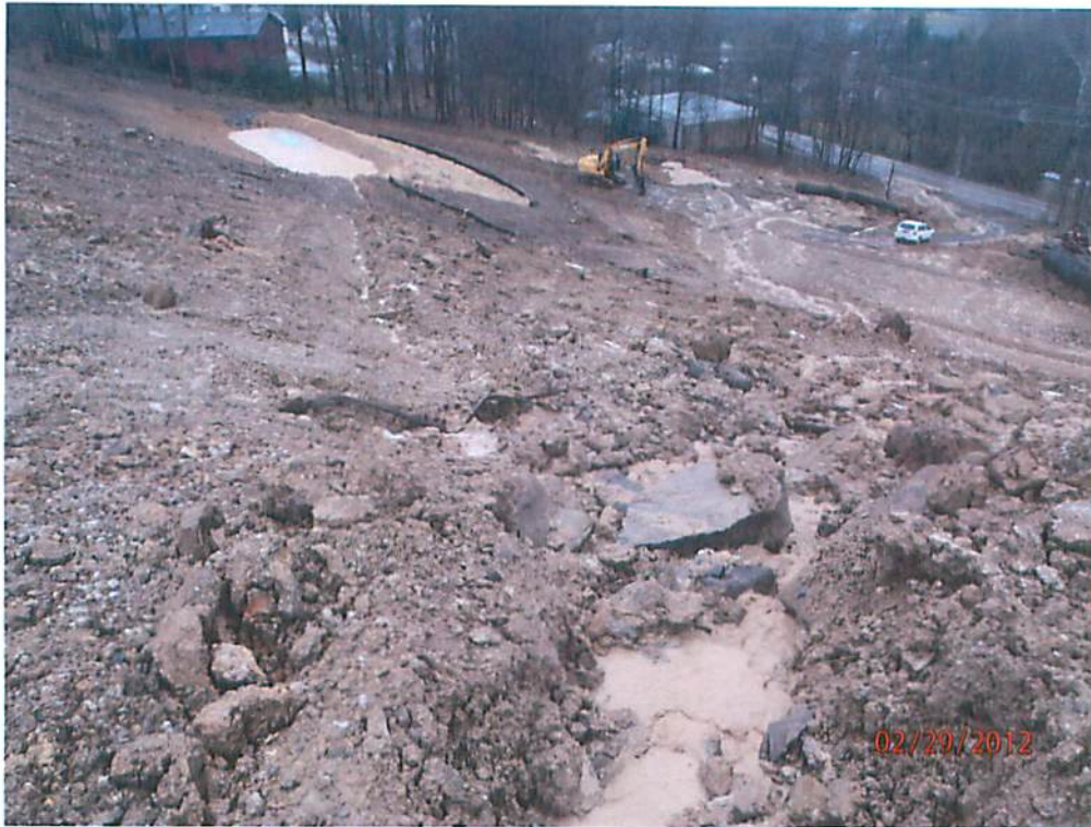
Sediment-laden water leaving down slope toward the highway instead of being diverted to the proper treatment device, Sediment Trap B (upper left). [P2290228]