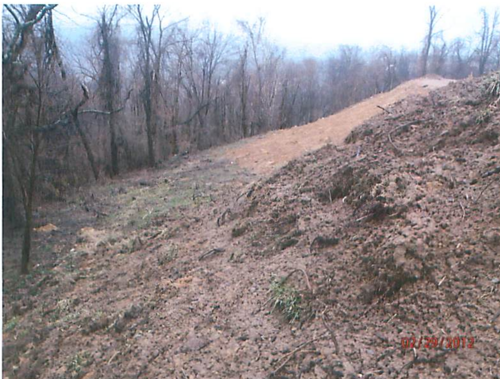
Super Silt Fence not installed as engineered on the approved erosion and sediment control plans. [P2290266]