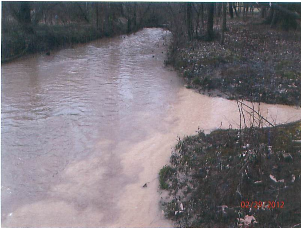
Conditions Not Allowable in State waters: Visible plume into White's Run. [P2290197]