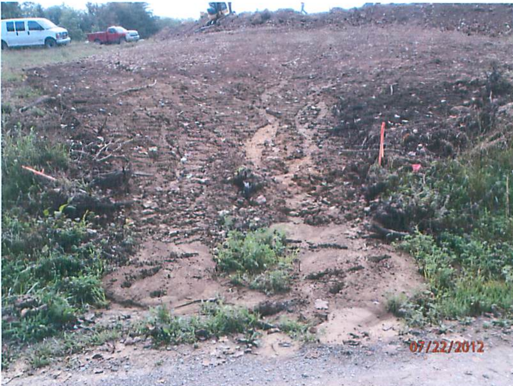
Evidence of sediment-laden water leaving site and onto Stockett Rd. with no controls in place.