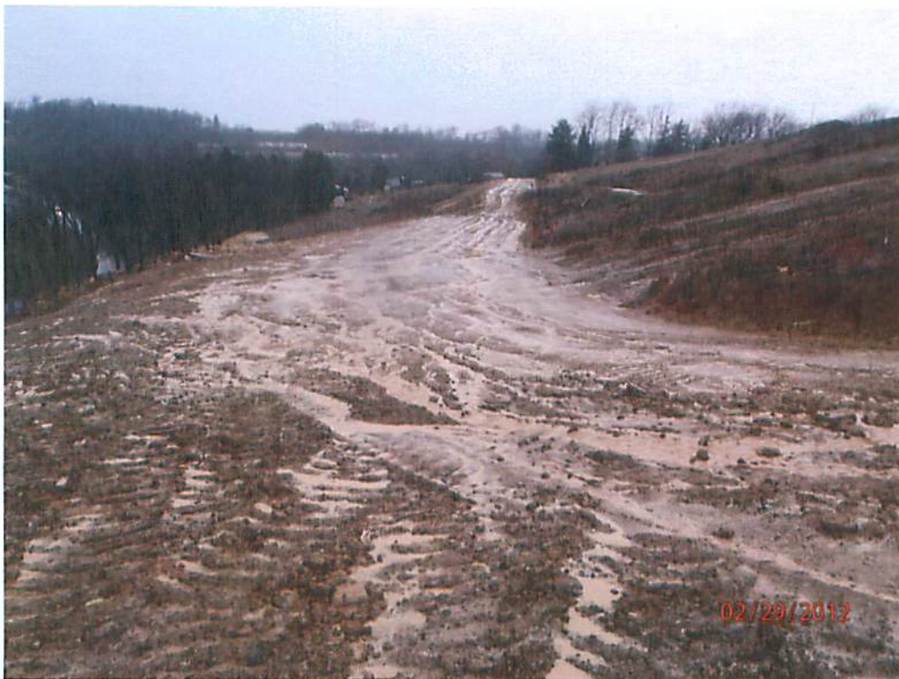
Runoff not diverted to Sediment Trap E as engineered, allowed to bypass Sediment Trap B below, and leaving the site onto the highway. [P2290293]