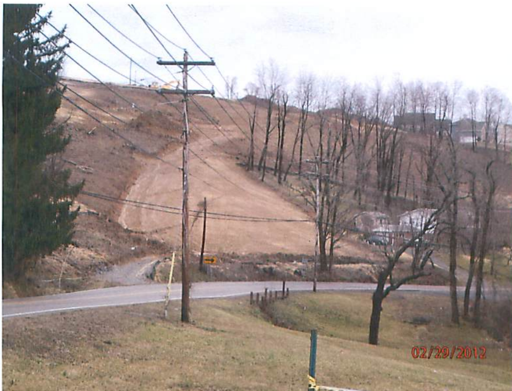
Large disturbance with few controls in place. [P2290152]