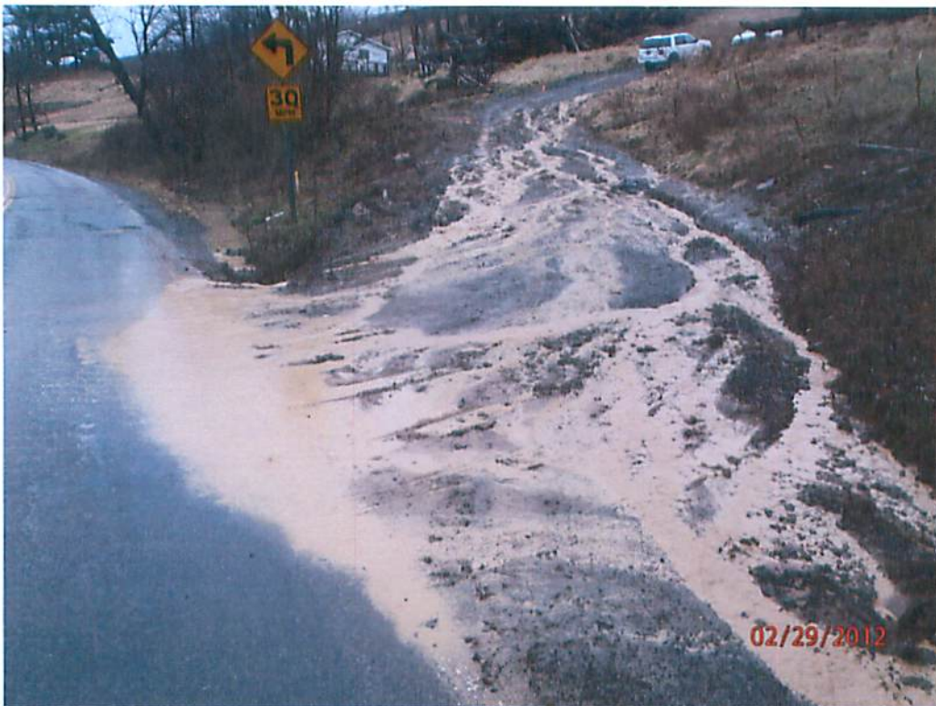
Runoff bypassing Sediment Traps E & B entering the highway. [P22903303]