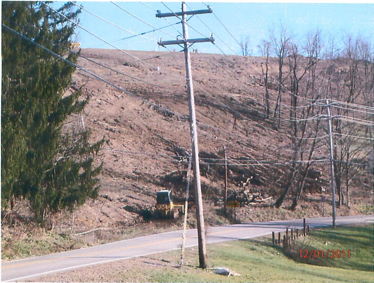
Earth disturbing construction activities occurring with no controls in place.