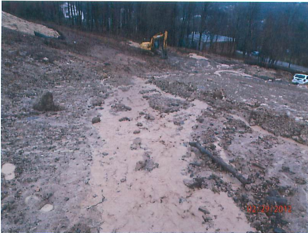
Runoff bypassing Sediment Traps E & B toward the highway. [P2290293]