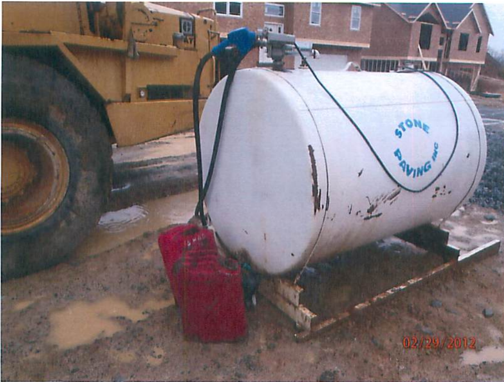
Poor ground water protection: Fuel tank with no secondary containment. [P2290271]