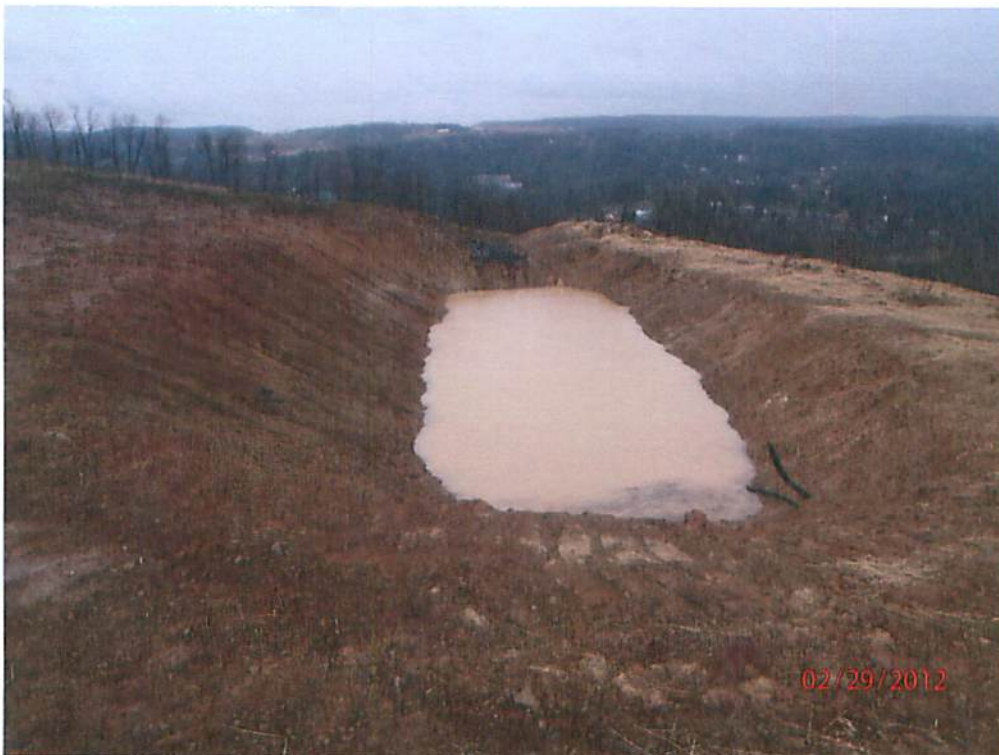
Sediment Trap D not collecting any storm water runoff for treatment before leaving the site. [P2290260]