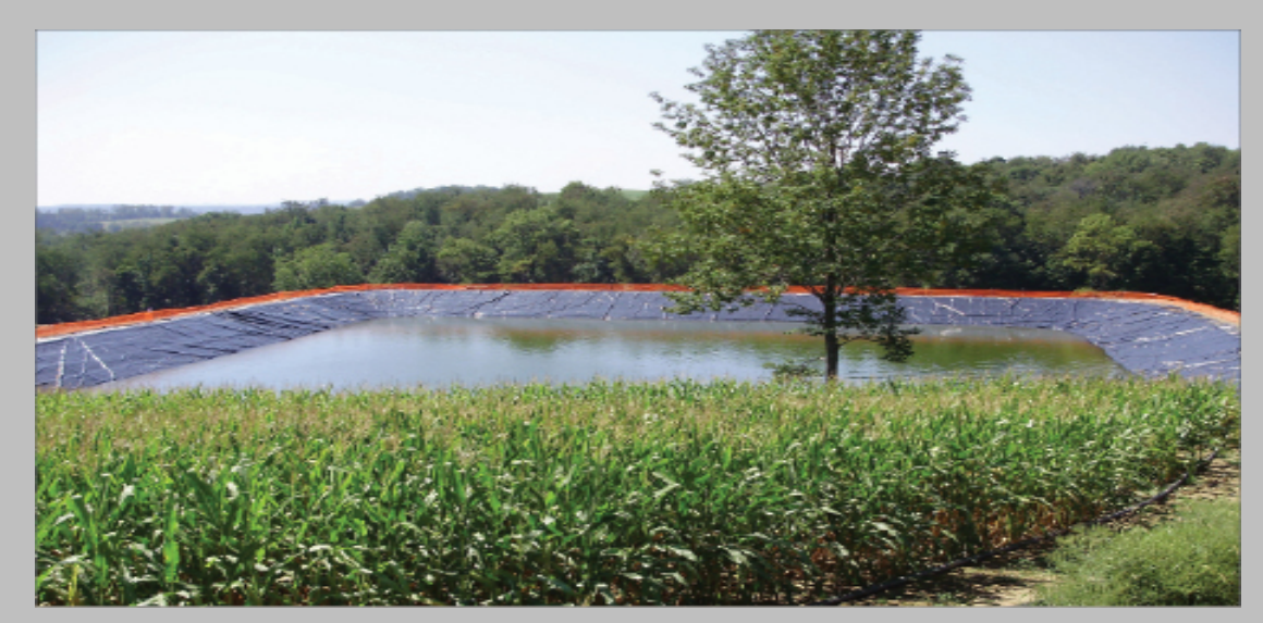
Water Management Plan Update: Oil and Gas Workshop, 05/16/2013