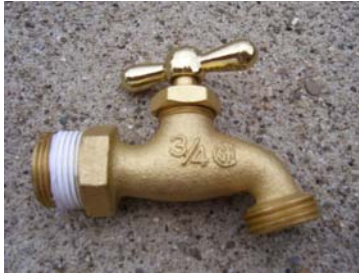
3/4" hose bib (spigot)