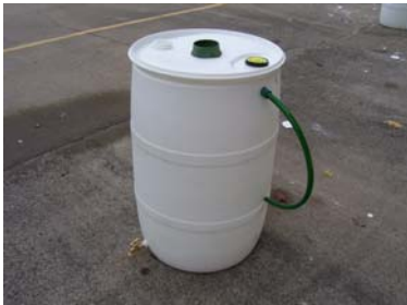
55-gallon food grade plastic barrel