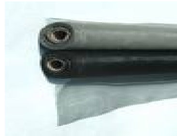
Fiberglass screen or mosquito netting