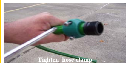
Tighten hose clamp