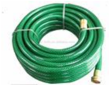
5' section of 5/8" hose