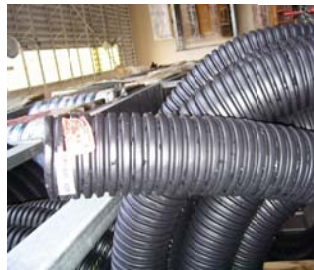
4" corrugated drain pipe