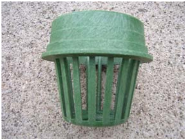
4" atrium grate