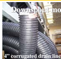
4" corrugated drain line