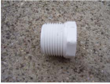
Two 1" x 3/4" male thread/female thread bushings