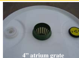
4" atrium grate