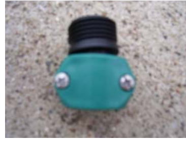
5/8" x 3/4" male coupler (for garden hose repair)