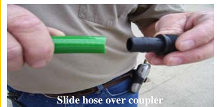
Slide hose over coupler