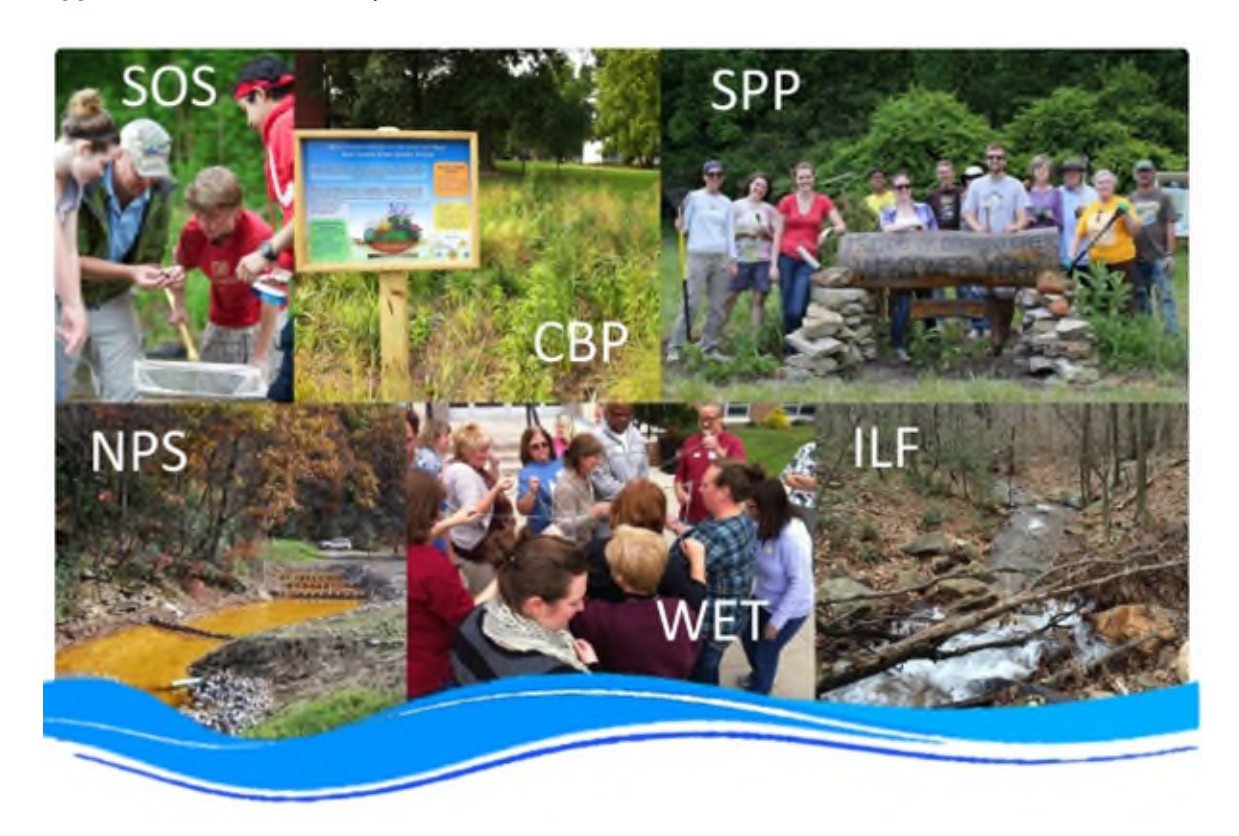
Appendix 4. Watershed Improvement Branch

The mission of WVDEP's Watershed Improvement Branch (WIB) is to inspire and empower people to value and work for clean water. WIB administers programs that educate, aid, plan and implement water quality protection, improvement, and restoration projects. The programs within the WIB include: